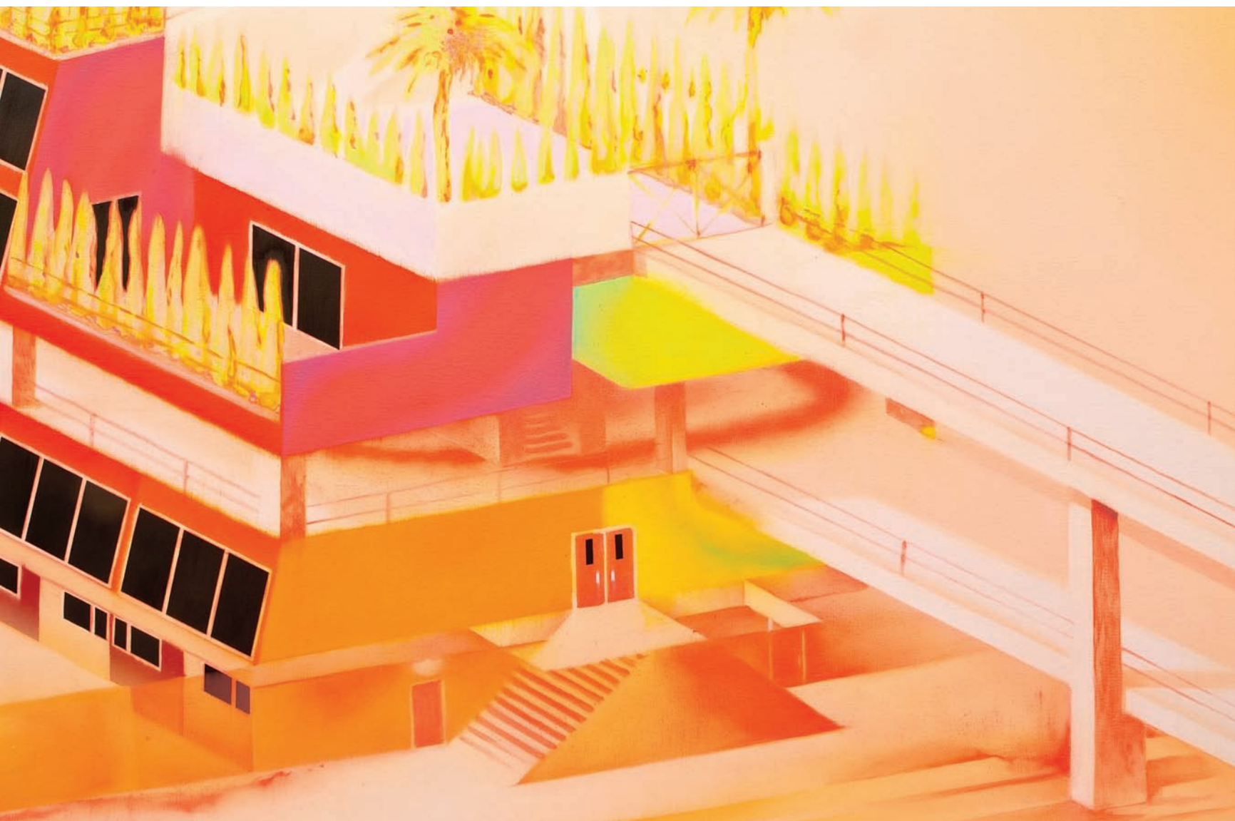
Nicolas Grenier, Vertically Integrated Socialism (Detail).